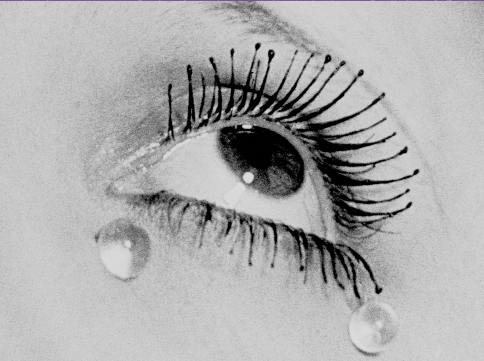
Man Ray, Larmes de verre (1932)

Building W (Max Weber) Ground Floor www.sem-france.org