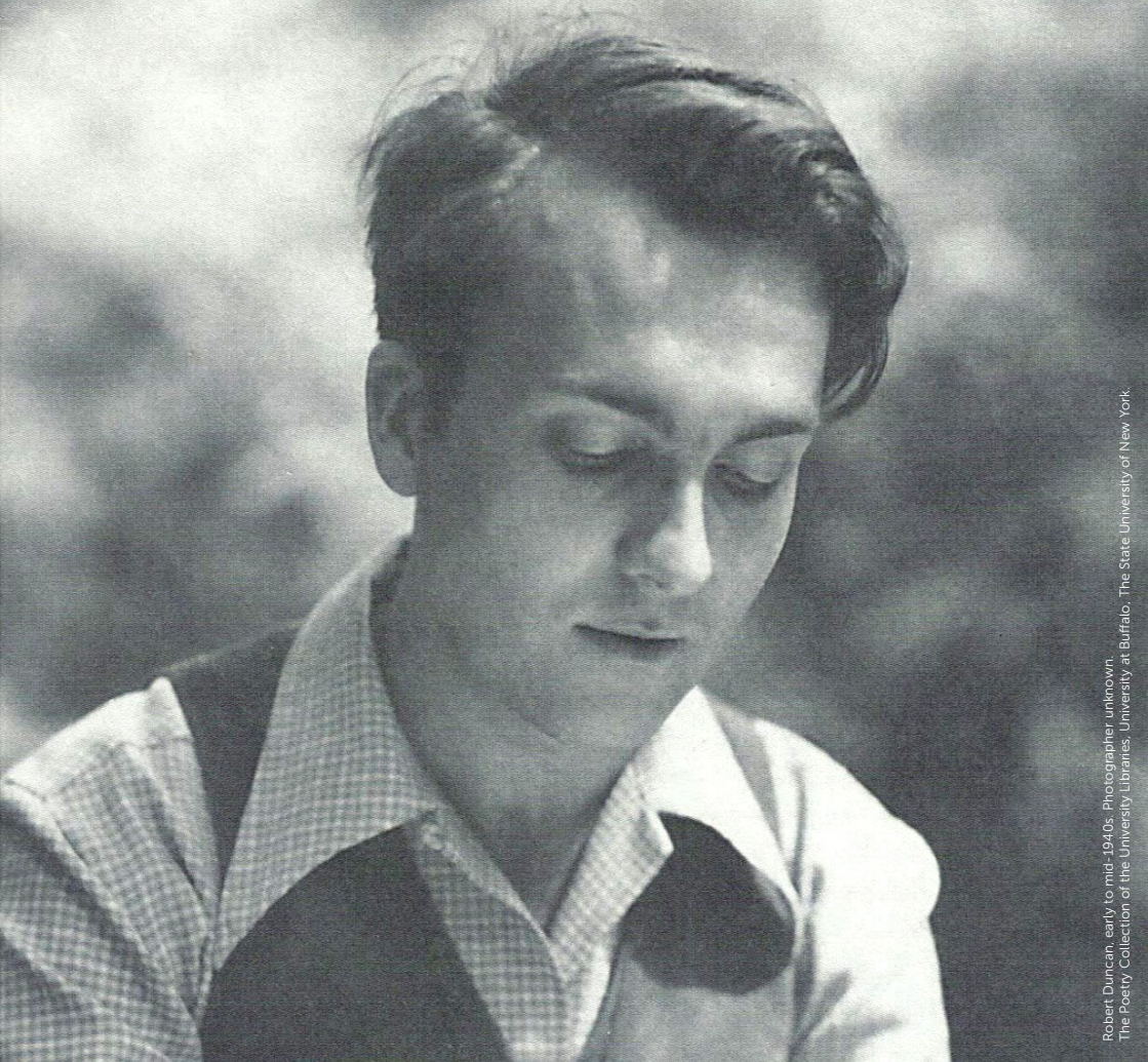
Robert Duncan, early to mid-1940s